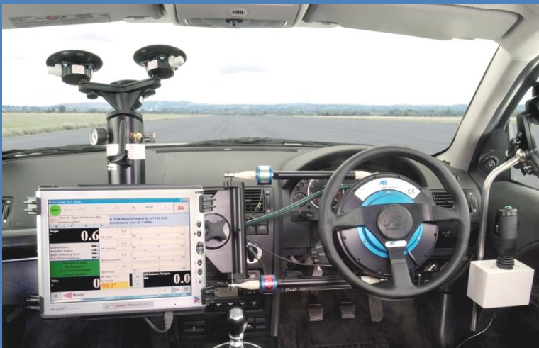
SR60 steering robot

ABD steering robots have been designed to apply inputs to a vehicle's steering system for testing transient handling behaviour on the test track, or for evaluating the steering system itself. They allow a wide range of steering inputs to be applied with high precision and repeatability, to enable high quality data to be gathered quickly.